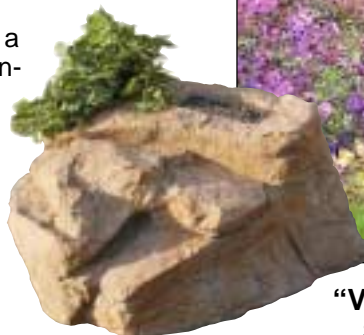
"Valor Rock" with 6" Planter Size: 29"(W) x 27" (L) x 13" (H) Weight: 95 lbs.