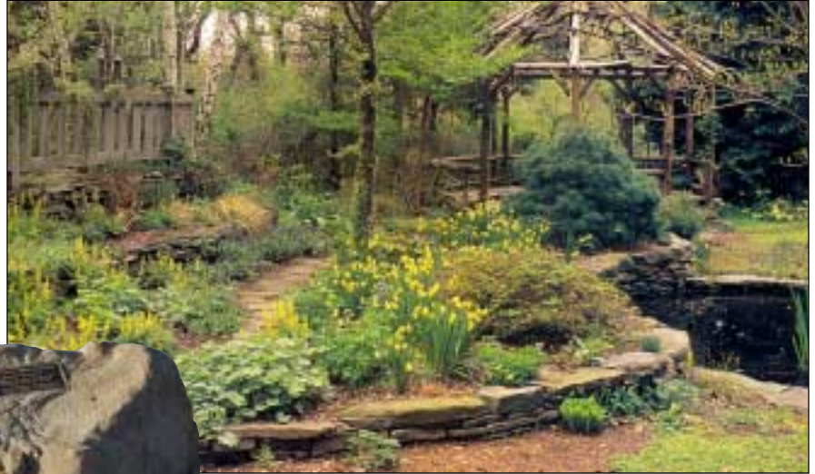
Keeping Their Memory Close To Home™

Actual Plaque Size: 3 1/2" x 7 1/4" Plaque Weight: 2.5 lbs.