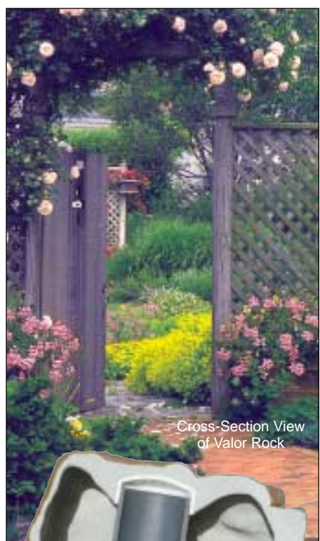
Cross-Section View of Valor Rock

Many people are discovering the monuments are a unique and much-appreciated means of commemorating or announcing a newborn's arrival, anniversaries ("Thank You For Being The Rock of My Life For 25 Years!"), weddings ("Wishing You a Rock-Solid Marriage!"), retirements, birthdays, corporate or community awards (i.e., Salesperson, Volunteer or Police Officer of the Year) or other special occasion.